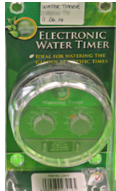
Substitute product supplied

Here, the substitute product is presented in imitation or 'copycat' packaging, increasing the likelihood that the customer may not realise the product delivered does not come from Kingfisher. Meanwhile, the opportunity to sell a genuine Kingfisher water timer is lost to the substitute seller.