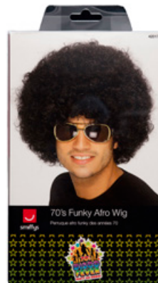
Genuine Smiffys product

RH Smith & Sons is the proprietor of a huge catalogue of high quality copyright-protected images and a portfolio of trade marks, including those for its key brands Smiffys, Fever and Time for Fun. We became concerned that many sellers using our IP rights across online trading platforms were unlikely to be selling genuine RH Smith & Sons' products. Test purchases revealed that our IP rights were being used without