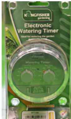
Kingfisher product advertised

The danger comes when substitute sellers of generic or imitation watering timers 'piggyback' on the Kingfisher listing in order to benefit from its higher-placed ranking and brand reputation while supplying a substitute product, as in the example below: