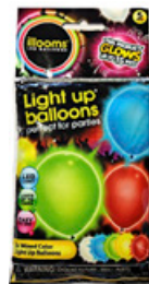
Genuine Seatriever product

Due to the success of ILLOOMS ® , a large number of substitute products have appeared on the market, selling mainly through websites such as eBay and Amazon (having been imported from China through websites such as Alibaba). When these do not conform with relevant safety standards, they may be unsafe and should not be distributed in the EU. Substitute products of poor quality attract negative reviews which, when wrongly attributed to ILLOOMS ® , damage our reputation and sales.