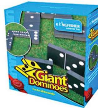
Kingfisher product advertised

Substitute sellers unlawfully benefit from the pulling power and high ranking of a Bonnington Plastics' online listing, whilst selling substitute goods, seen in the example below: